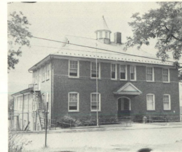
FACTORYVILLE ELEMENTARY SCHOOL

Nicholson Elementary School, erected in 1920, was expanded by the addition of two wings in 1931. It contains 11 classrooms, cafeteria, kitchen, an office, teachers conference room, gymnasium-auditorium and a special education room.