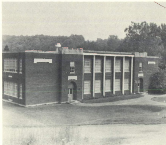
DALTON ELEMENTARY SCHOOL